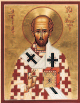
SAINT JOHN CHRYSOSTOM